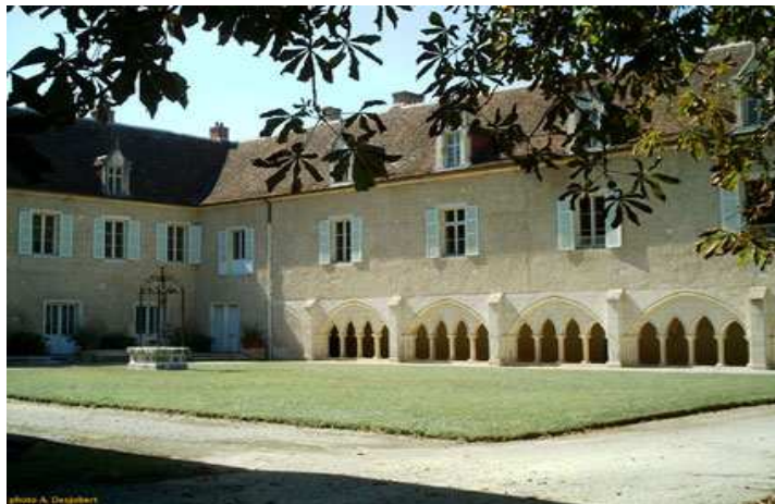
Abbey of La Prée : artists in residency program

In its capacity as a public non-profit charitable organization, Pour Que l'Esprit Vive is entitled to accept tax deductible donations, universal or private estate gifts, life insurance, works of art, bank accounts, titles to property exempt of transfer or inheritance taxes. The association is able to undertake certain obligations (see page 13).