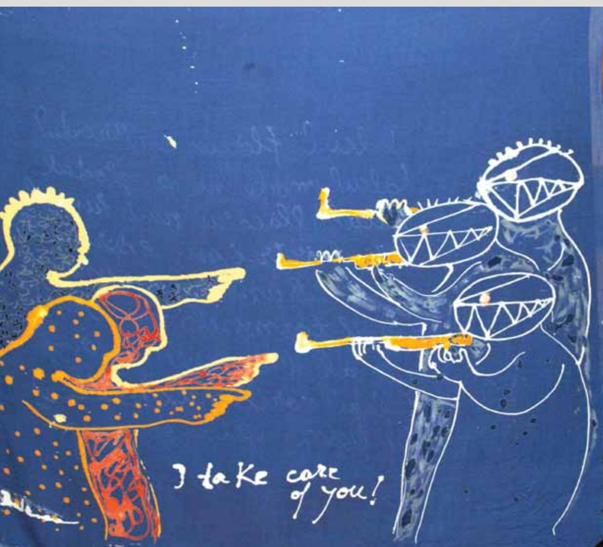
I TAKE CARE OF YOU